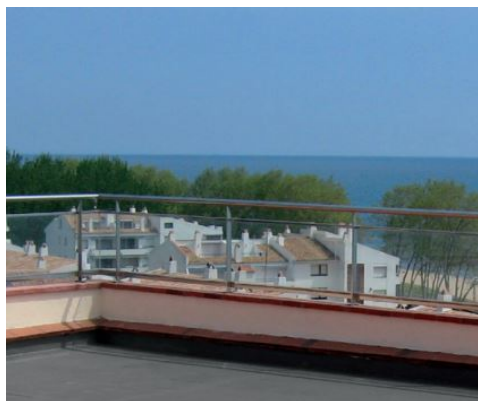
Paving slab waterproofed with Aquaflex Roof

Aquaflex Roof: ready-mixed liquid elastic membrane with fibres for waterproofing exposed surfaces. Complies with the requirements of EN 1504-2 coating (C) principles PI, MC and IR