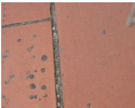
An example of old terracotta floor requiring treatment before applying Aquaflex Roof