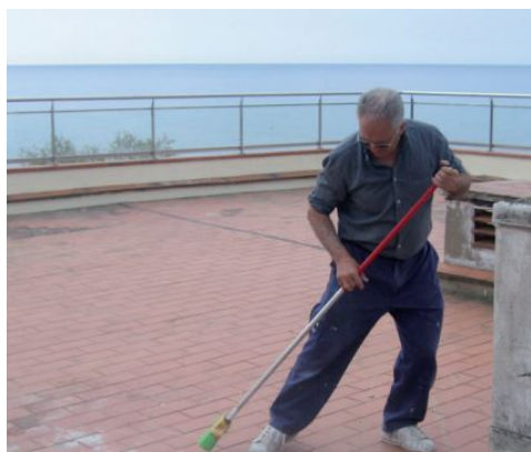
Cleaning a substrate before applying Aquaflex Roof